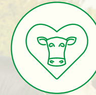
Animal Health & Welfare