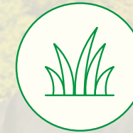
Soil & Animal Nutrition