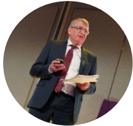
MAY 2023: KEPAK CEO SPEAKS AT MBW CONFERENCE