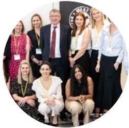
APR 2021: STRATEIC PARTNERSHIP BEGIND