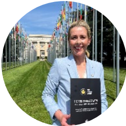
JUNE 2024: PEOPLE LEADERS ROUNDTABLE