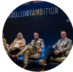
MAY 2025: KEPAK FOODS CEO SPEAKS AT MBW CONFERENCE