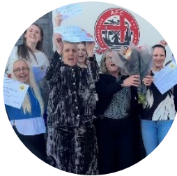
JAN 2025: LAUNCHPAD PILOT